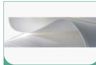
Industrial Filter Fabric